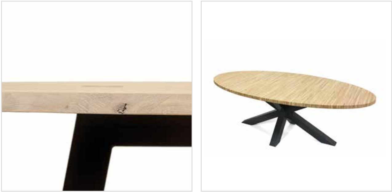
Table "Sanne" by Binthout®