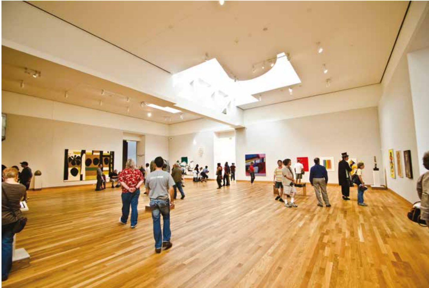
Weissmann Museum, Minnesota - Country: USA Product: Rubio Monocoat Oil Plus 2C Colour: Pure Wood type: American Oak