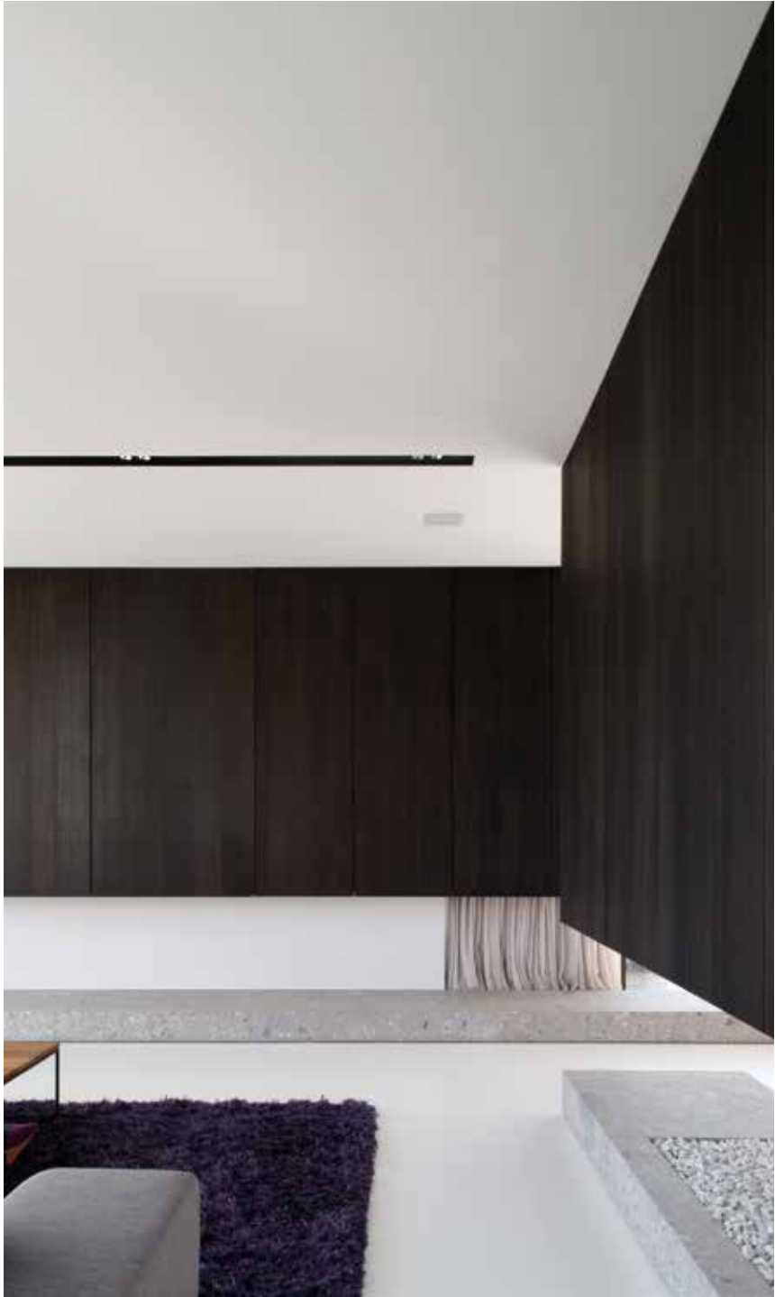
PVM Architects, Roeselare - Country: Belgium Product: Rubio Monocoat Oil Plus 2C Colour: Custom Made Wood type: Oak Veneer