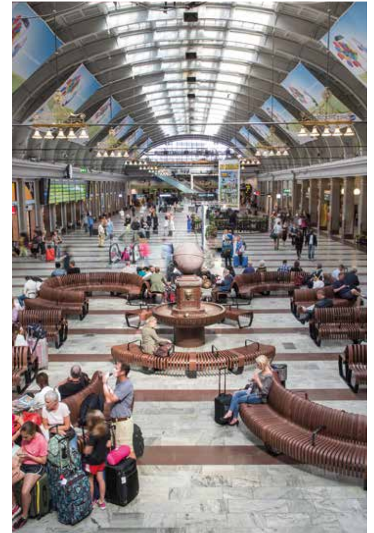
Central Station, Stockholm

Country: Sweden Product: RMC Oil Plus 2C