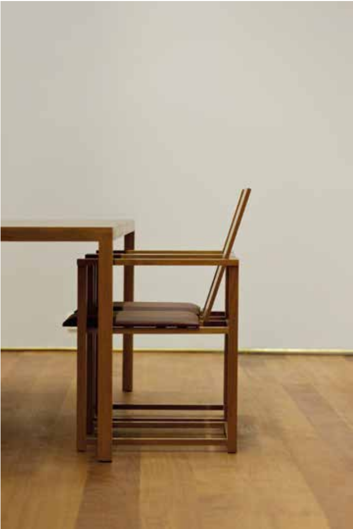
Crematory, Kortrijk - Country: Belgium Product: Rubio Monocoat Oil Plus 2C Colour: Pure Wood type: Afzelia