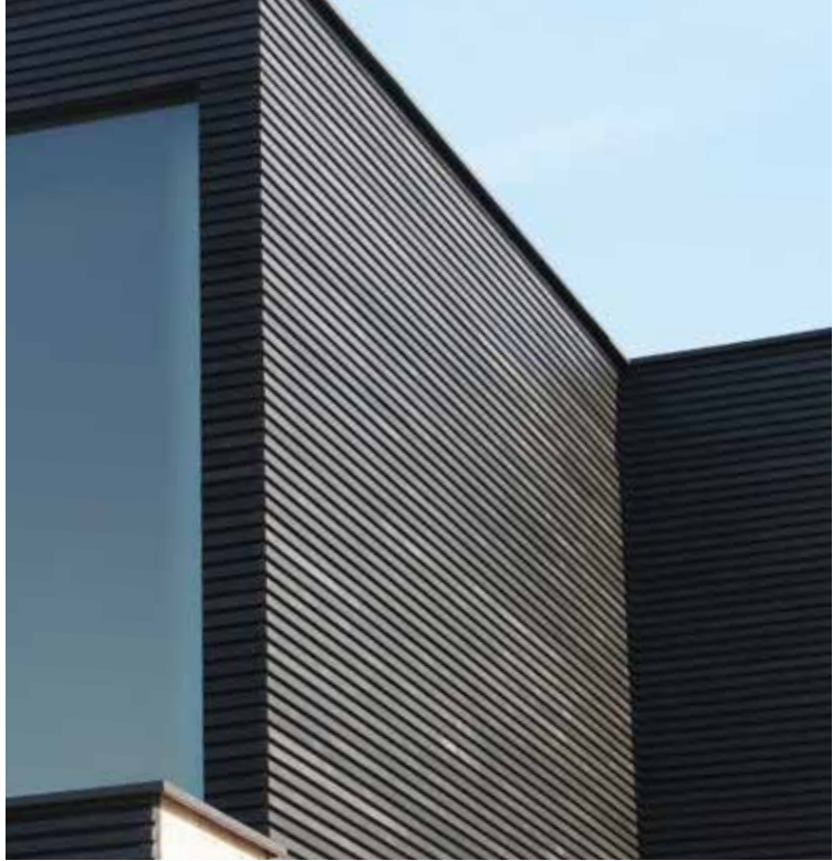
DB Hardwoods, Ledegem - Country: Belgium Contractor: DB Hardwoods Product: RMC Siding Oil Duo System Colour: Charcoal Wood type: Cedar